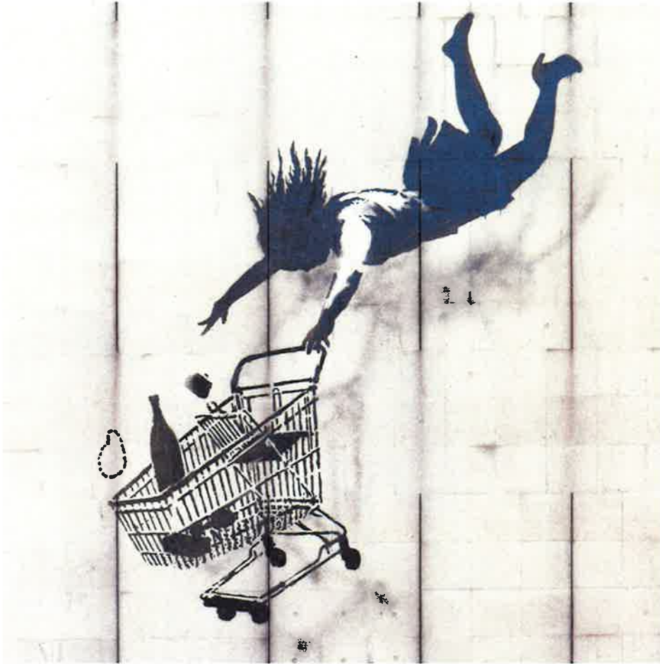
"Shop Until You Drop" by Banksy is licensed under CC BY-SA 3.0