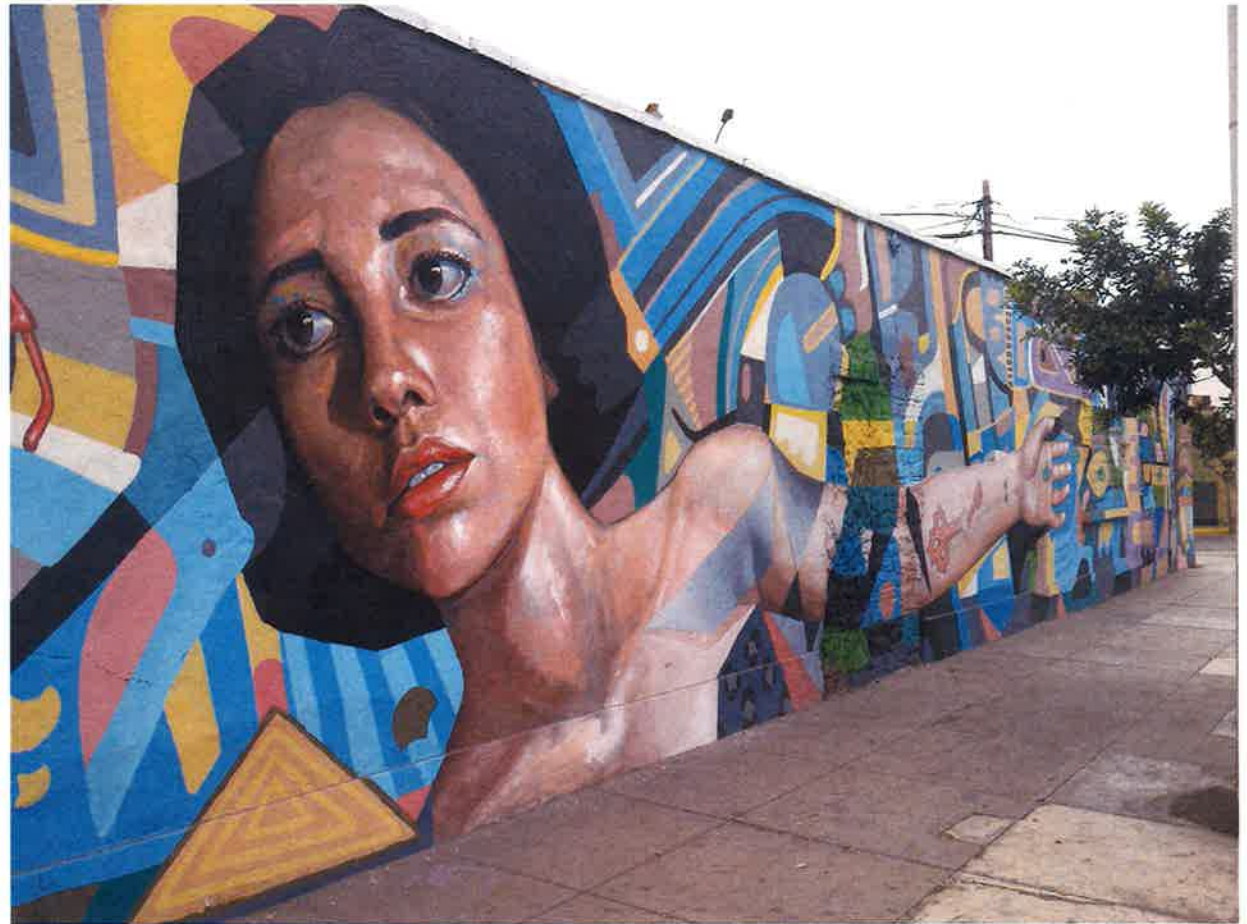
"Graffiti in Lima, Peru" by Santiagostucchi is licensed under CC BY-SA 3.0

The natural surroundings of Tacoma and the Puget Sound